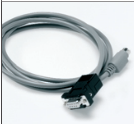
Interface EBI-6-RS 232