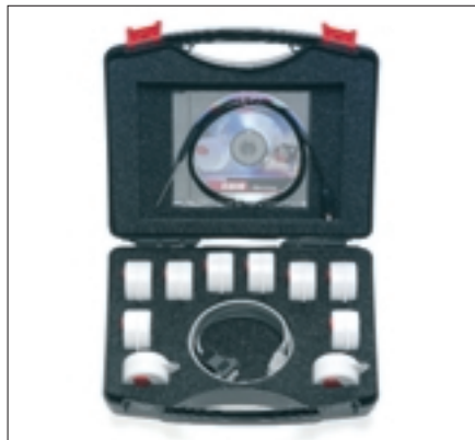
Transport case EBI-6-KOF