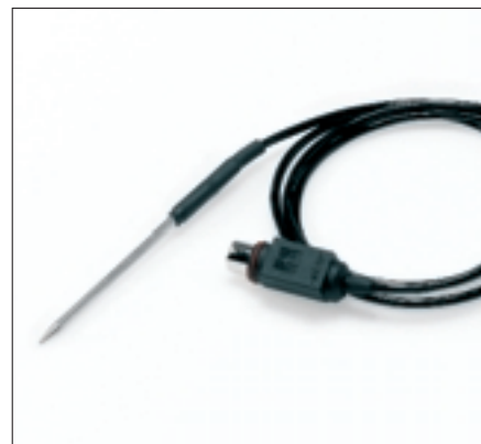
Penetration probe EBI-6-FUE