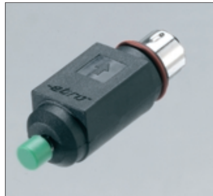
Start/Stop button EBI-6-SST