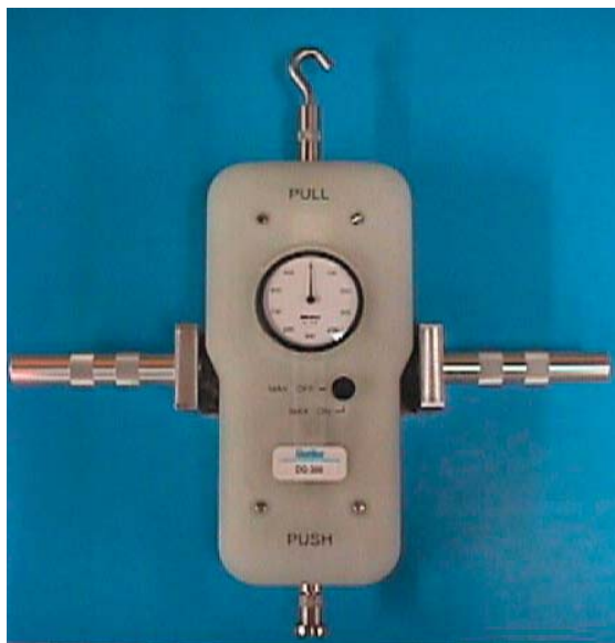
DG Series force gauge shown with optional Handle Set Assembly (p/n SPK-DG-Handle).