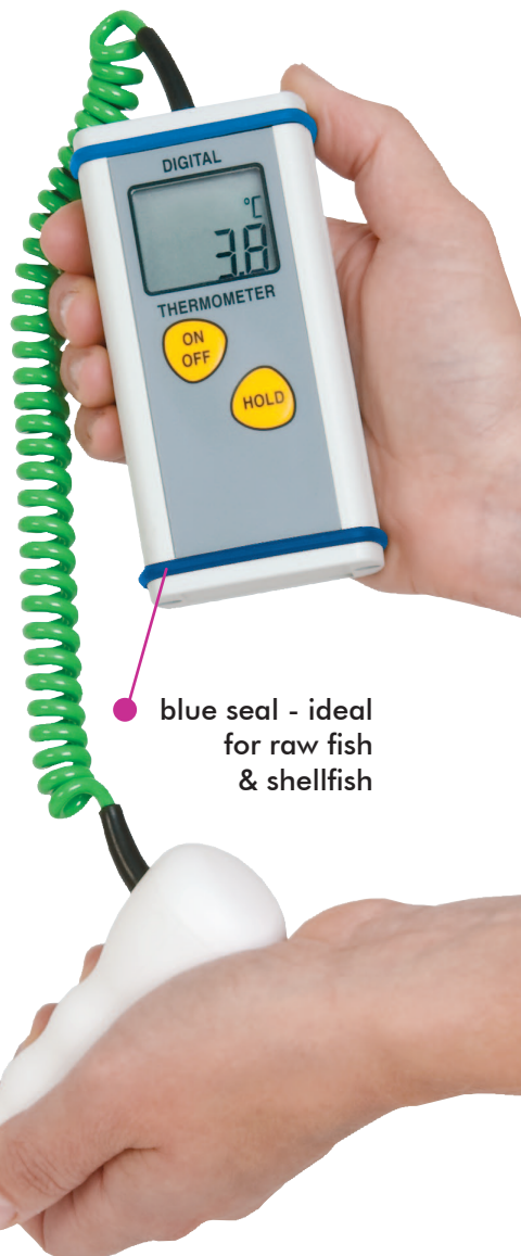
● blue seal - ideal for raw fish & shellfish