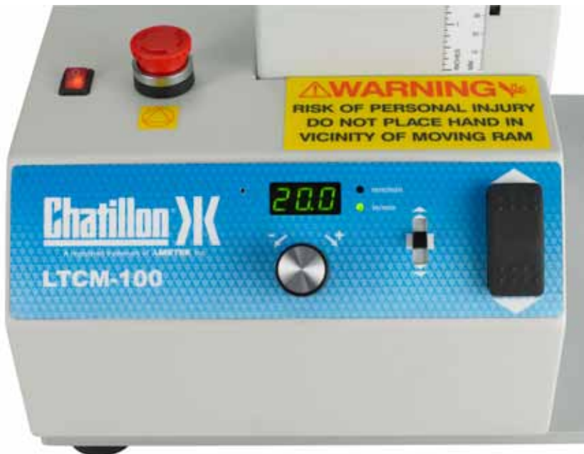
Shown: Control panel is designed to promote ease-of-use. All controls are located on the control panel and away from the work area, making the LTCM100 Series ideal for busy production environments.