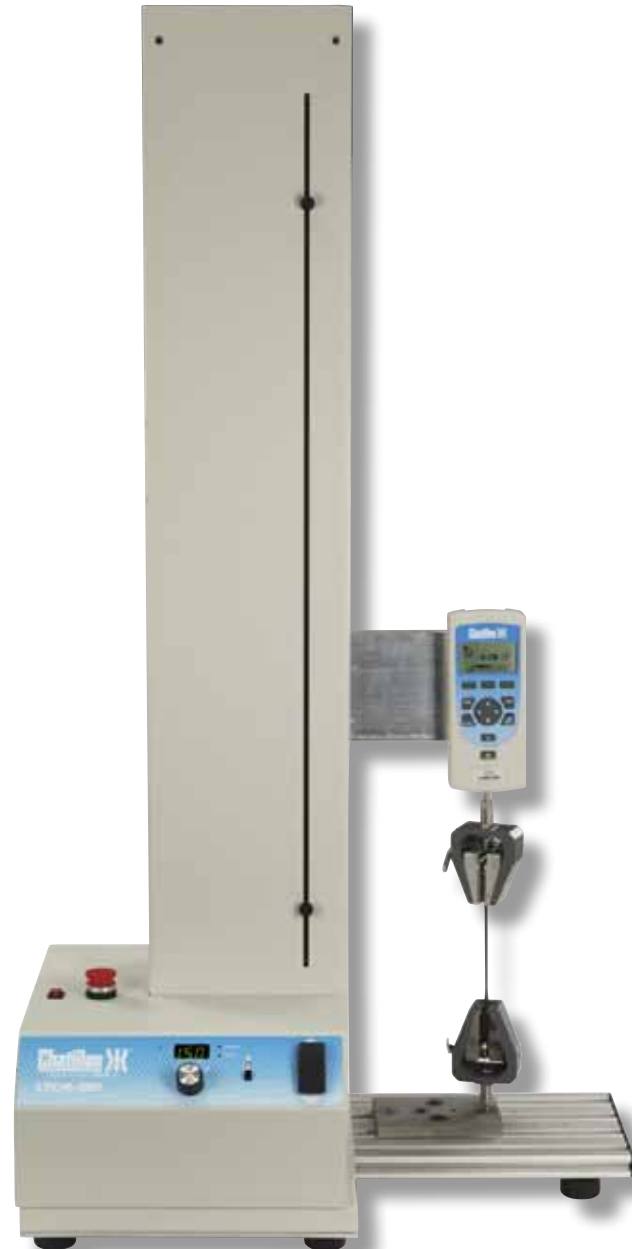
Shown: LTCM500 Series with optional DFS Series force gauge.