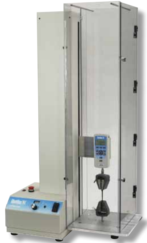
Shown: The LTCM500 fitted with optional splinter shield.

The crosshead has been optimized for use with Chatillon DF Series digital forces gauges. The DF Series mount directly to the crosshead without special adapters. The work surface features a T-slot table for installing grips or special fixtures.