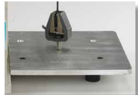
Shown: An optional extended work table fits onto the T-Slot. Pre-drilled holes make fitting fixtures and specialized testing jigs easy.